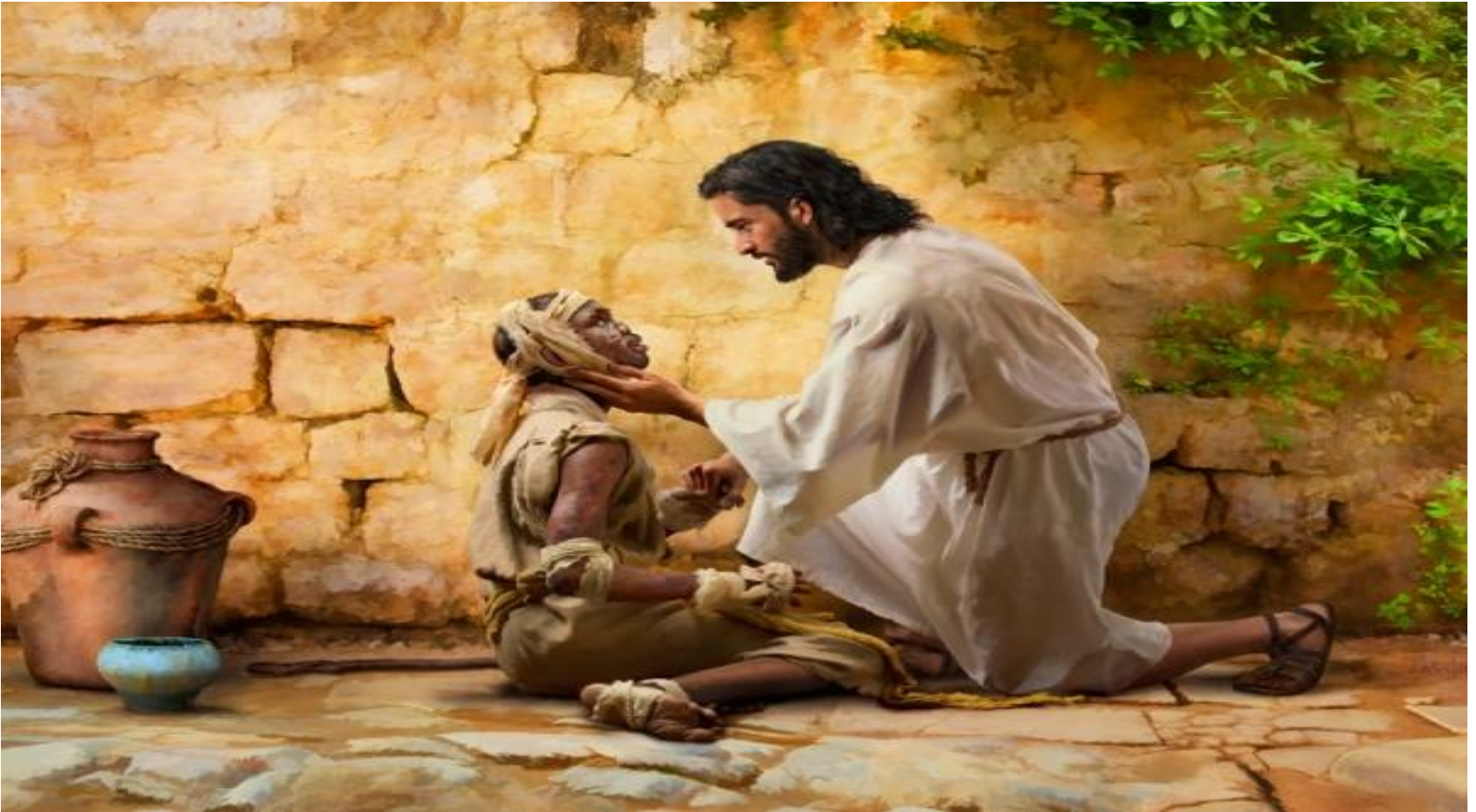
The Healing of the Man with Leprosy Mark 1:40-45 cf., Matthew 8:2-4; Luke 5:12-16