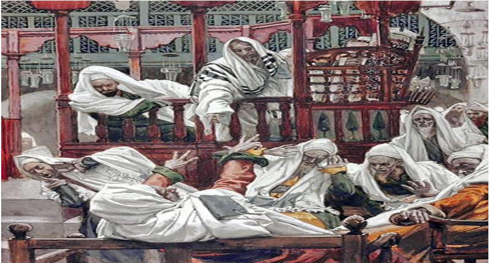
Healing Of A Demoniac in the Synagogue by James Tissot

The Casting Out Of The Demon In The Synagogue At Capernaum Mark 1:21-28; cf., Luke 4:31-37