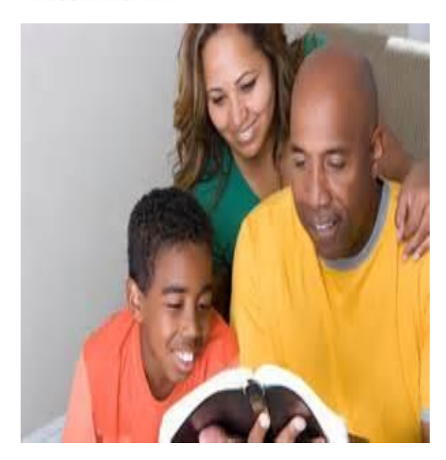
EX.DE48EE8 [09] C arway assumption on cons

Blessed Hope Bible Church www.bhbcstl.org